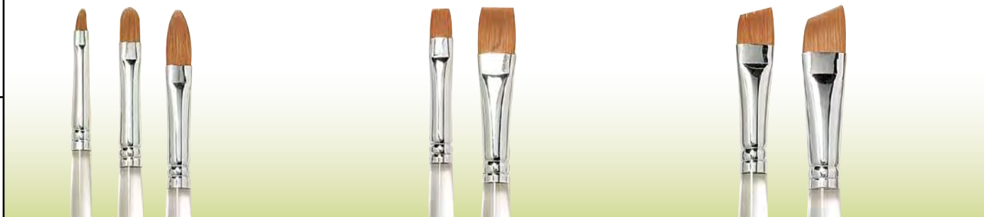
TB 701 No. 2 Filbert TB 702 No. 6 Filbert TB 734 No. 8 Filbert For loading and tipping techniques, varying strokes and cursive lettering. Excellent for blending and shading, and solid-color coverage on small areas.