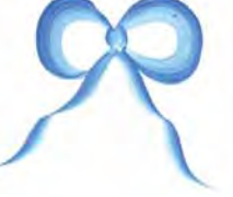
SB 804 No. 4 Shader