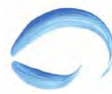
SB 802 No. 1 Liner

For fine features, small lettering, delicate shading and slender linework.