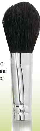
BR 588 No. 10 Oval Mop

For application of glaze and underglaze to broad areas.