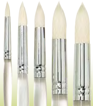
BR 551 No. 3 Round Opaque BR 552 No. 5 Round Opaque BR 553 No. 8 Round Opaque BR 604 No. 10 Round Opaque BR 605 No. 12 Round Opaque

For solid-color coverage, drybrushing and design work.