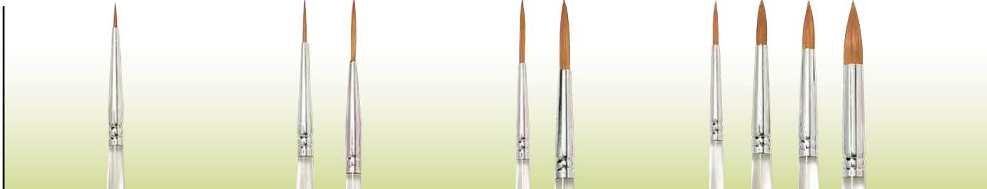
TB 720 No. 1/0 Detail For small details and brushstrokes.