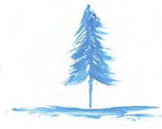
SB 807 No. 6 Fan Glaze

For smooth, even application of solid color and shaded design work.