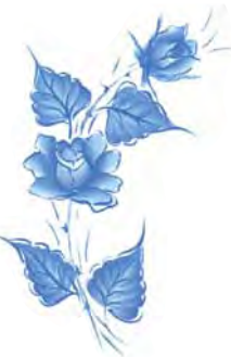
SB 808 No. 4 Round

For shading, lettering, ribbon effects, varying line widths, banding and drybrushing.