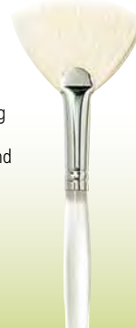
BR 575 No. 3 Fan

For creating textures, patterns and banding.