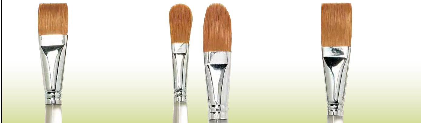
TB 733 3/4" Flat Shader For basecoating and more. Chisel edge is ideal for floated strokes and shading.