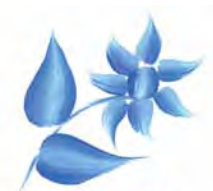
SB 803 No. 4 Liner

Create a range of brushstrokes from elaborate designs to exacting details.