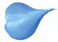
SB 813 1" Glaze Brush

Ideal for applying glaze or color over large areas and creating lightly feathered brushstrokes.