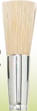
BR 589 Duster

For removing dust from bisque or dry greenware.