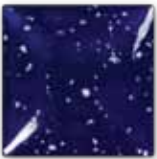
IN1212 Cobalt Blue Sprinkles