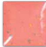
IN1214 Honeysuckle Sprinkles